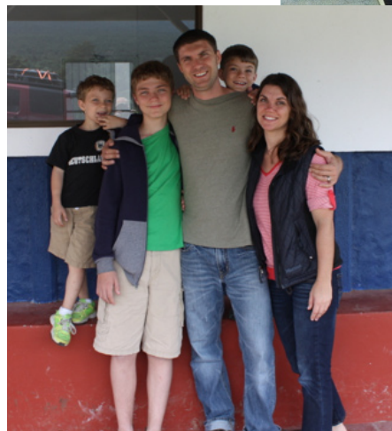
<<Our family during a recent road trip to Costa Rica