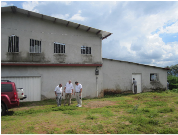
the church facility at El Renuevo